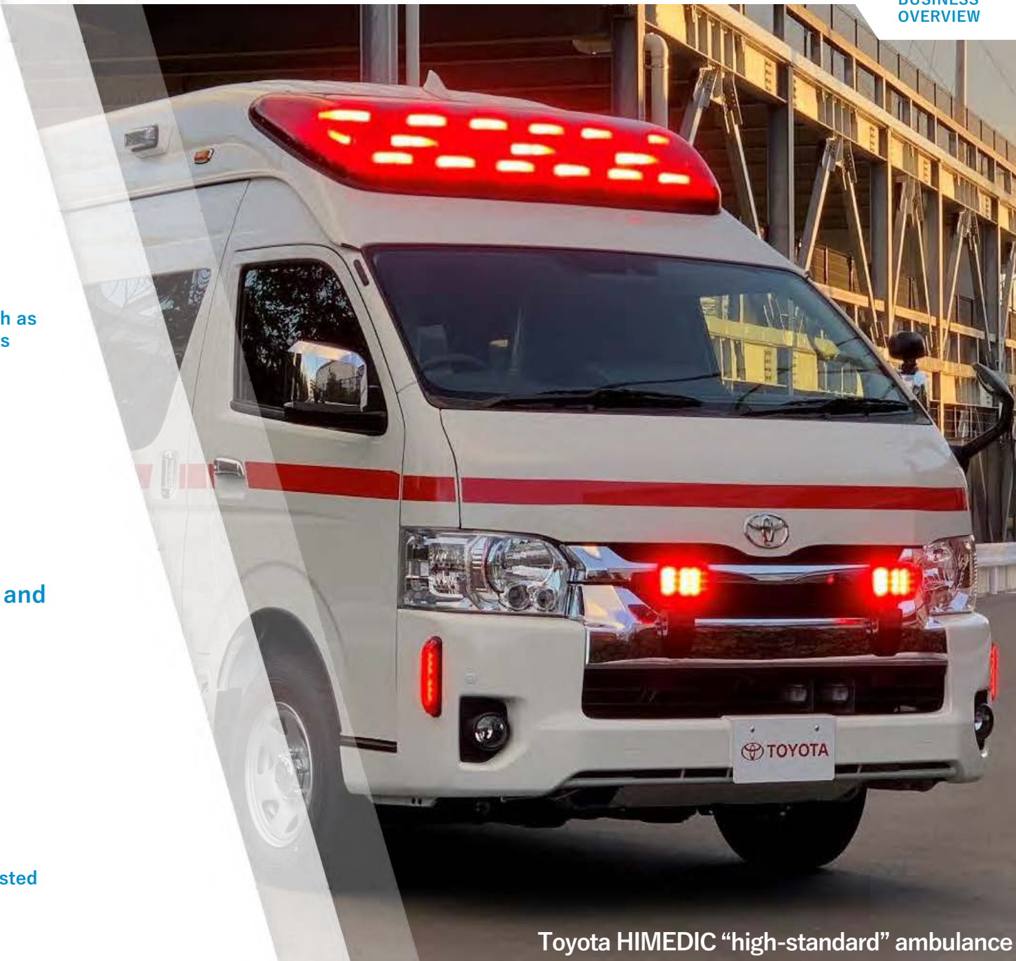
Toyota HIMEDIC “high-standard” ambulance

We support Toyota by receiving their special requested of advanced development of vehicles