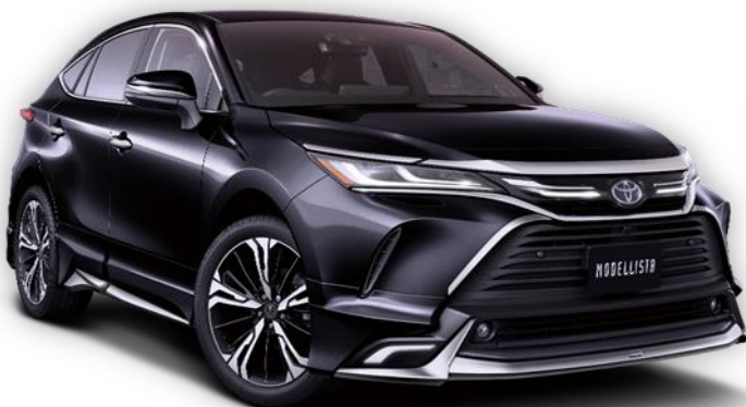
MODELLISTA HARRIER MODELLISTA Ver.