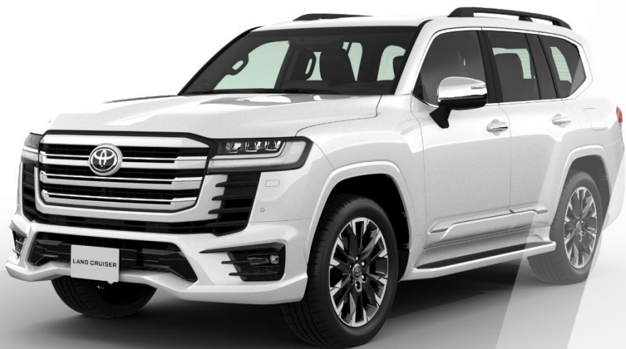
LAND CRUISER 300 Overseas Ver.