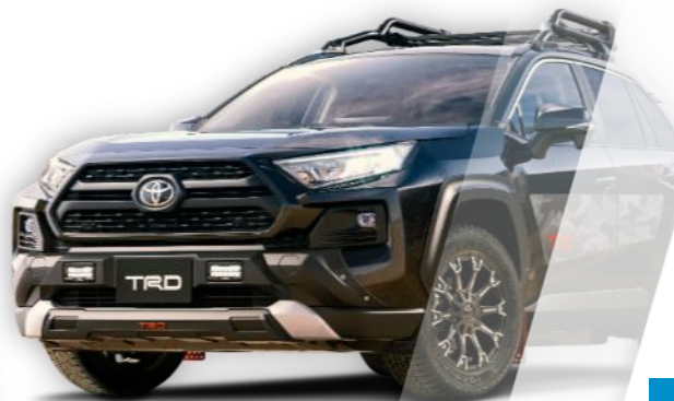
Racing Development TRD RAV4 TRD Field Monster