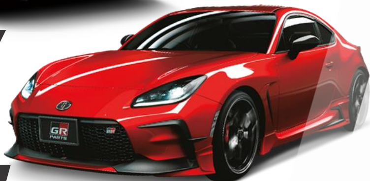
GR PARTS GR86 GR PARTS