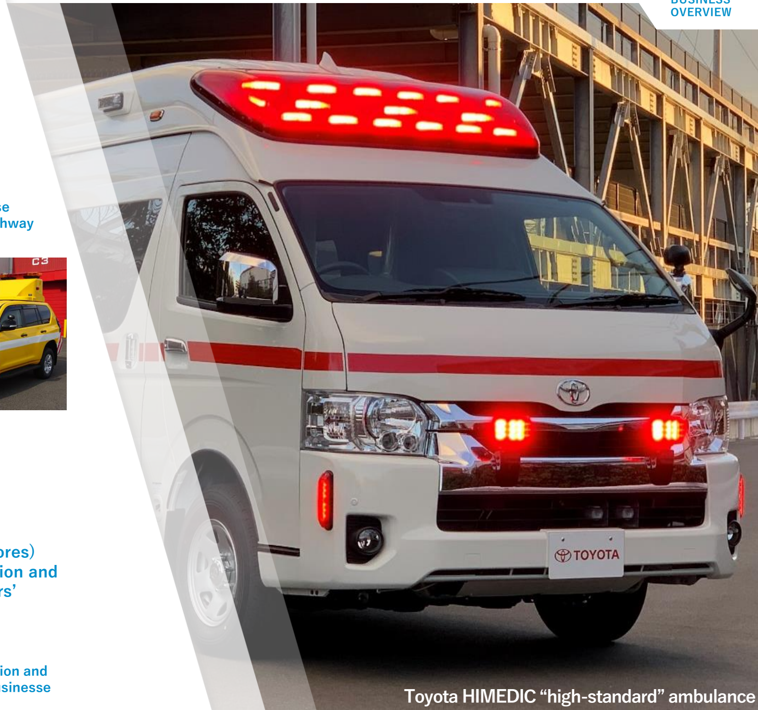
Toyota HIMEDIC “high-standard” ambulance